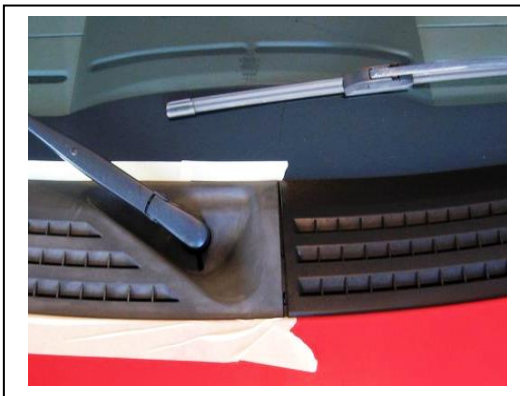
Windshield Wiper Housing