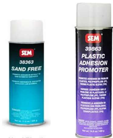
Hard Plastic (ABS, PVC)